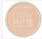
Rimmel Stay Matte Powder (F)

Role markers: F = Formulation PD = Product Development, P I= Problem Improvement