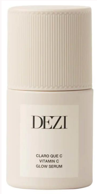
DEZI Claro Que C Vitamin C Glow Serum (F)

SELECTED SKINCARE, TREATMENT-LED, LIP, BODY CARE (MASS & PRESTIGE)