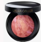
Laura Geller Baked Cheek Compact